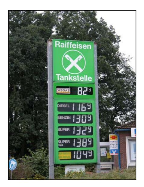
Figure 6. Biogas station.