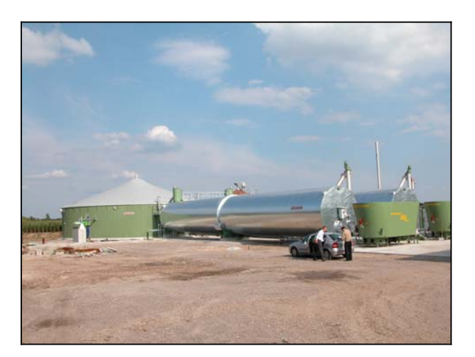
Figure 5. Horizontal digester.